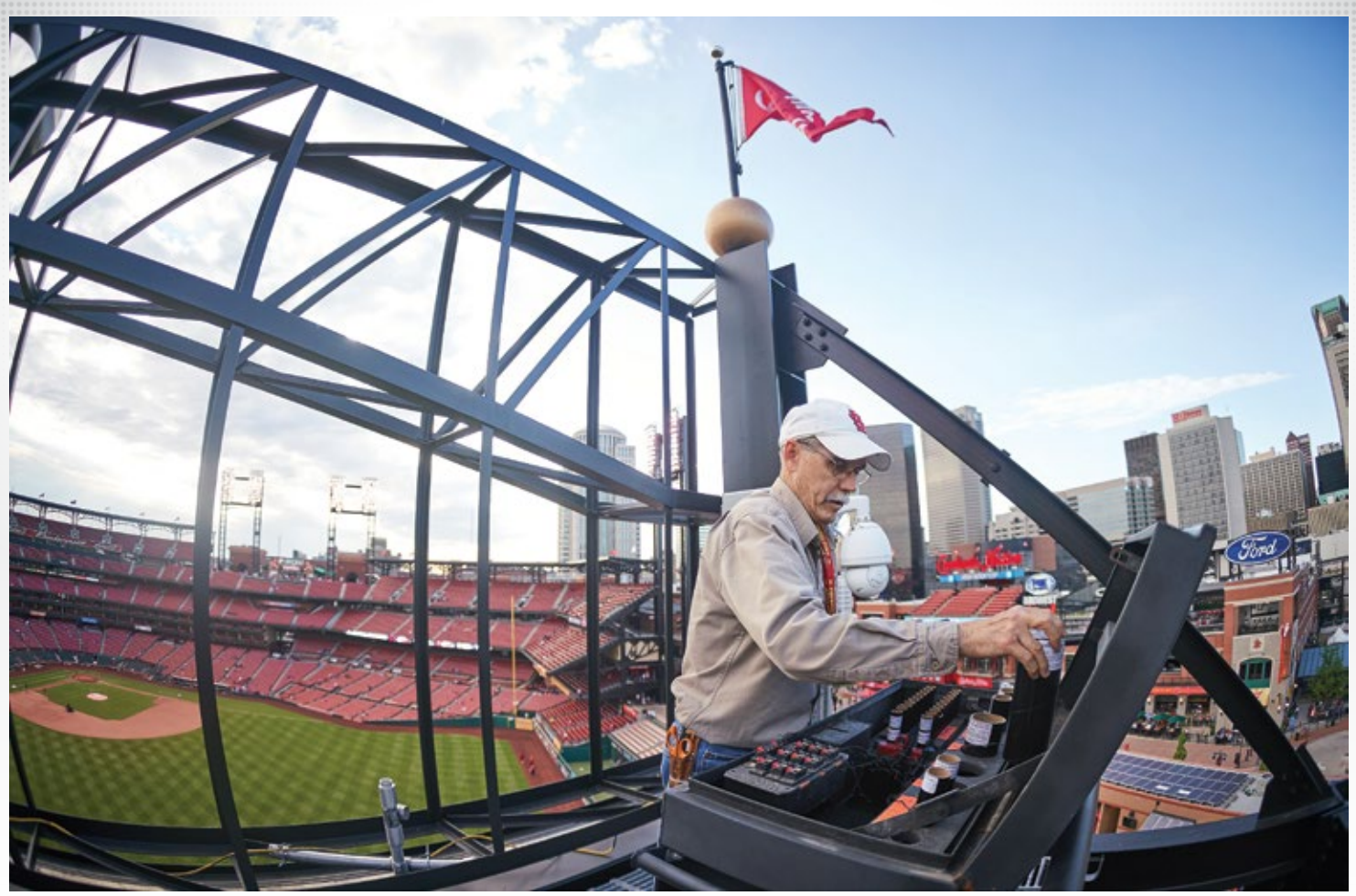
Weiter keeps three "firing boxes" loaded at all times - enough for three Cardinals home runs and a postgame victory blast.

property. After we put it in the water – and got a safe distance away – nothing happened for a while. But then, finally, the water shot way up in the air. It was great.